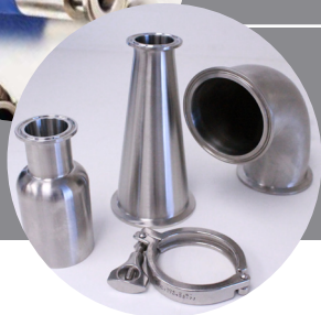
STAINLESS SANITARY FITTINGS & VALVES