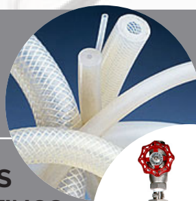
HI-PURITY TUBING & ASSEMBLIES