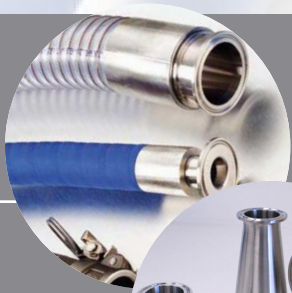
PROCESS HOSE ASSEMBLIES