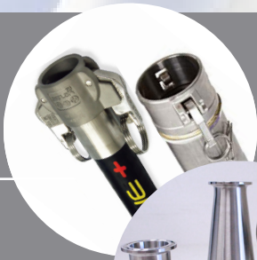
PROCESS HOSE & ASSEMBLIES AVAILABLE