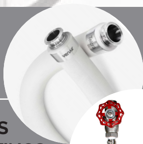
CONDENSATION-FREE HOSE ASSEMBLIES