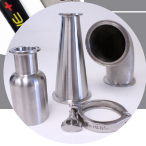
STAINLESS SANITARY FITTINGS & VALVES