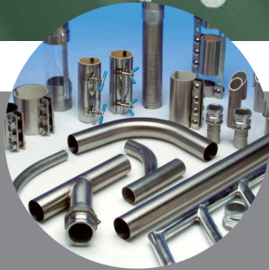
MORRIS COUPLINGS PNEUMATIC CONVEYING